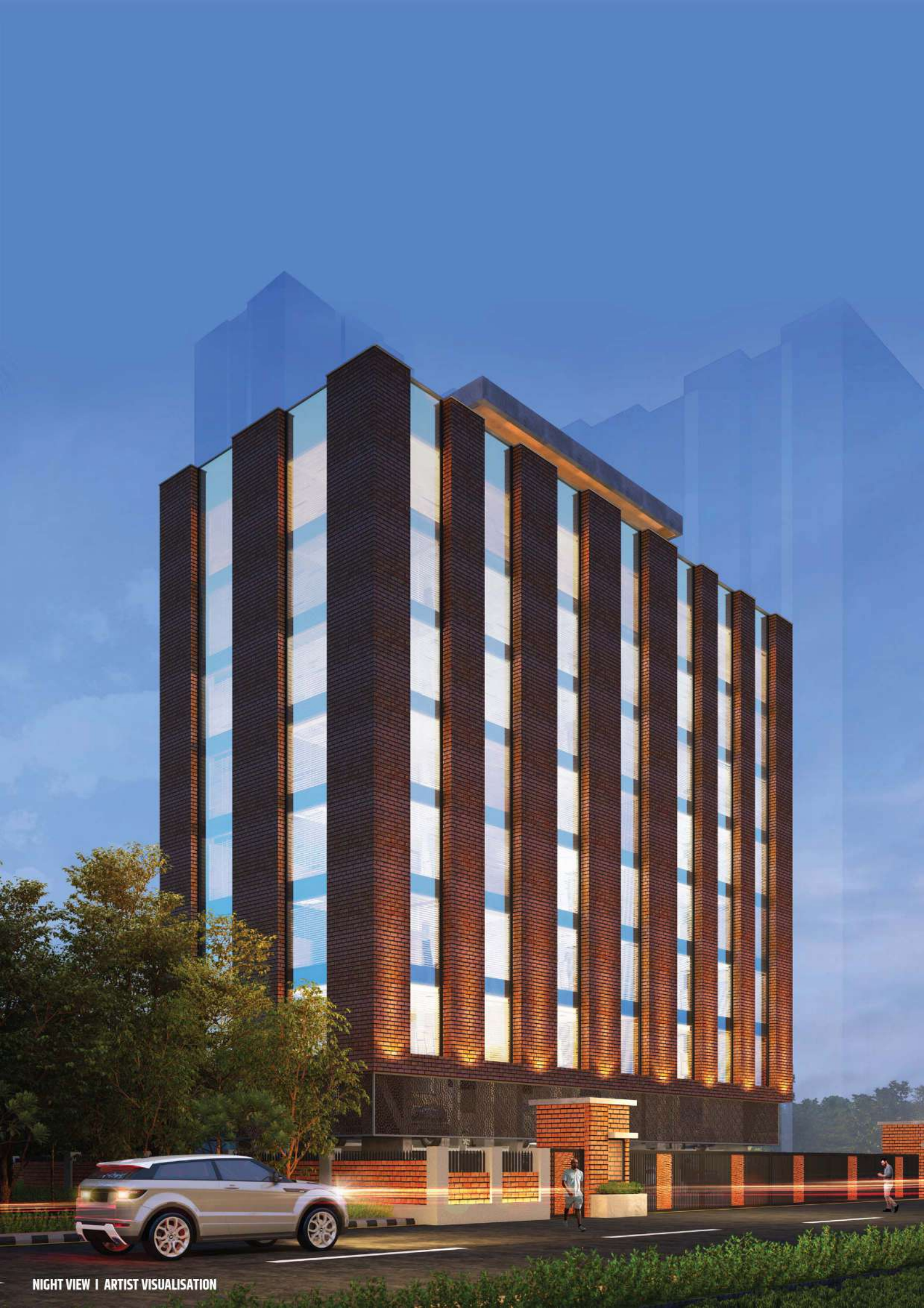
NIGHT VIEW | ARTIST VISUALISATION